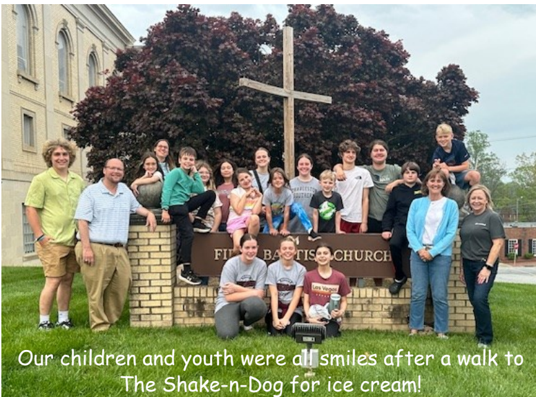
Our children and youth were all smiles after a walk to The Shake-n-Dog for ice cream!